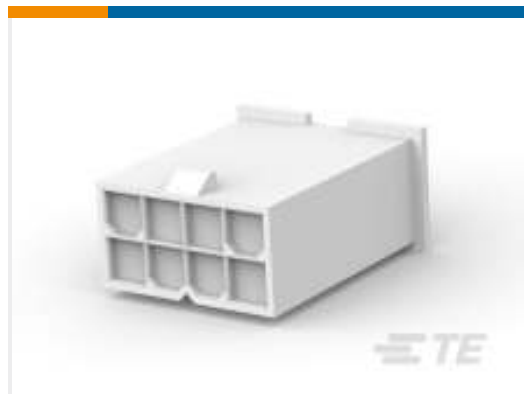
TE Part # 1969612-8 8P FH PLUG VAL-U-LOK V0