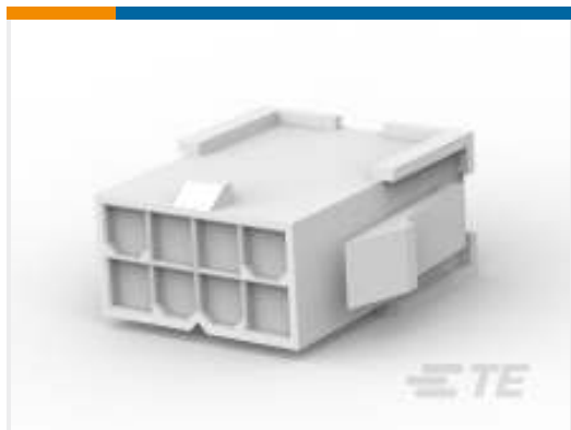
TE Part # 1969613-8 8P PM PLUG VAL-U-LOK V0