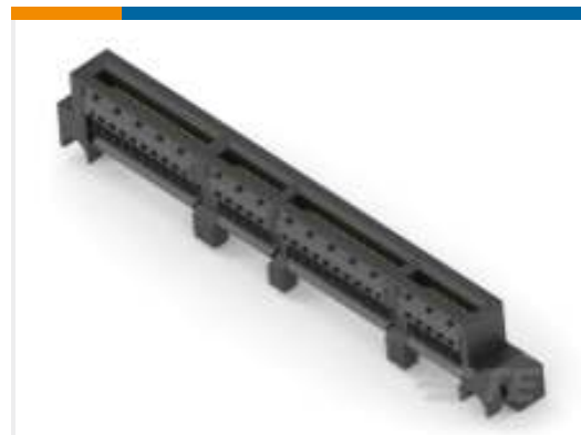
TE Part #1-2340321-2 ASSY STRADDLE MOUNT 168P 076 SLIVER 2.0