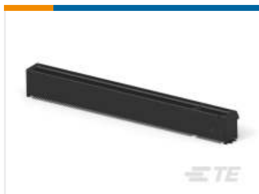
TE Part #5-2358477-8 PCIEG4,SMT,V,164POS,30u,ML,HT,SC