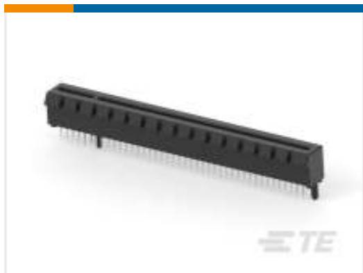
TE Part #2364834-2 PCI EXP 3.1 164 POS BLK 15u\", SLOT CHANGE