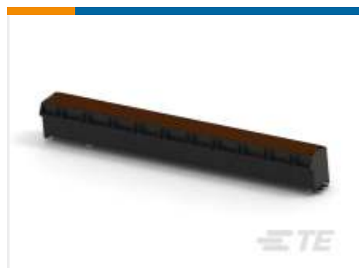
TE Part #5-2337939-8 PCIE GEN4 CON,SMT,164POS,30u\", MYLAR,HT