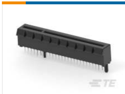
TE Part #2364834-1 PCI EXP 3.1L 98 POS BLK 15u\", SLOT CHANGE