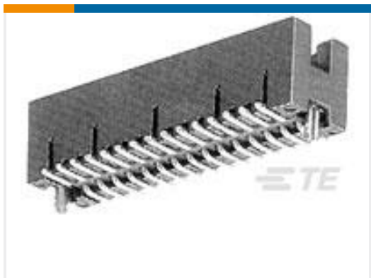
TE Part #5-147381-3 30 50/50 HDR SMT.250 W/HD SN