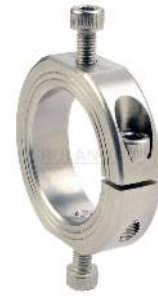
*Additional hardware #01 included