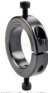
*Additional hardware #01 included