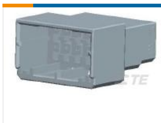
TE Part #1-1903130-6 DYNAMIC 1200D TAB HSG 12P F/H