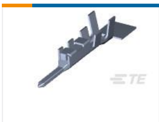
TE Part #1903126-1 DYNAMIC D1000 TAB CONT TIN (2L) L /P