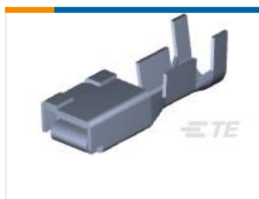
TE Part #179956-3 DYNAMIC D-5 REC CONT M FORM.