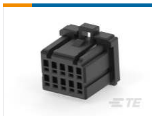
TE Part #1-1903128-3 Receptacle and Tab Housing: 2.0 mm pitch, 125V