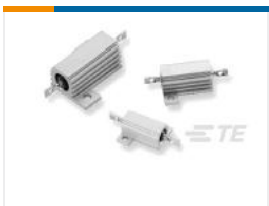
TE Part #3-1879071-0 THS50 27R 5%