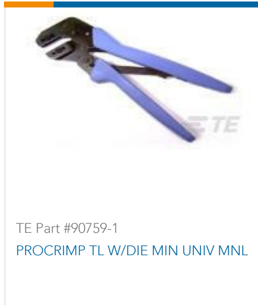
TE Part #90759-1 PROCRIMP TL W/DIE MIN UNIV MNL