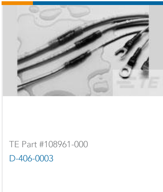
TE Part #108961-000 D-406-0003