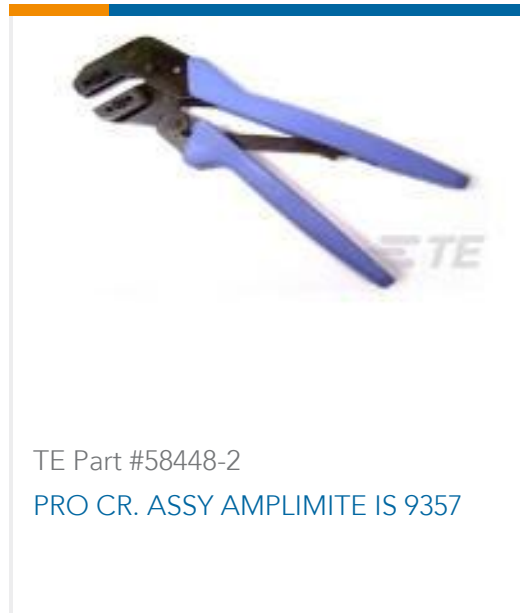
TE Part #58448-2 PRO CR. ASSY AMPLIMITE IS 9357