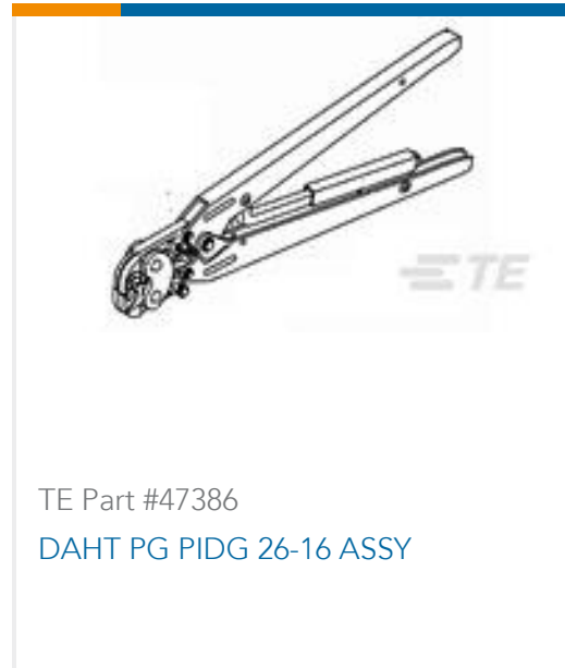
TE Part #47386 DAHT PG PIDG 26-16 ASSY