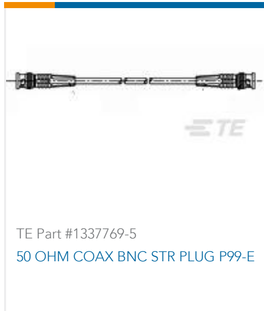
TE Part #1337769-5 50 OHM COAX BNC STR PLUG P99-E