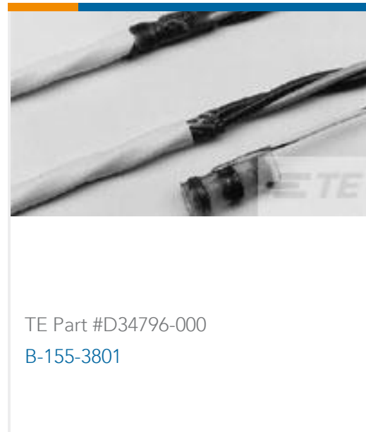
TE Part #D34796-000 B-155-3801