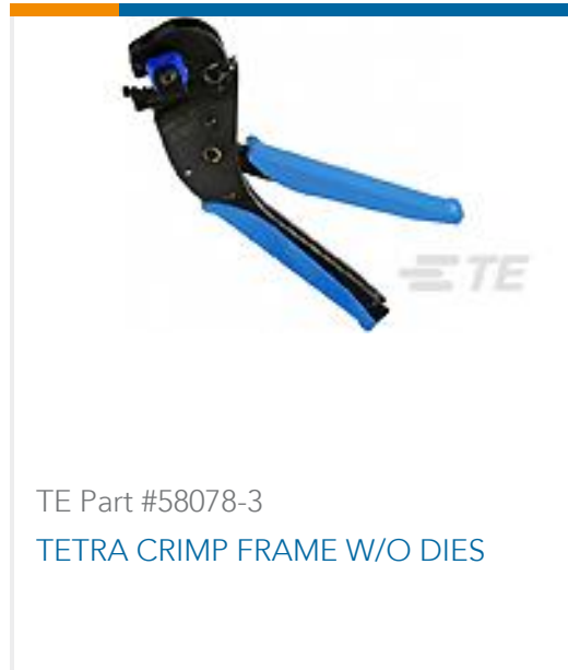
TE Part #58078-3 TETRA CRIMP FRAME W/O DIES