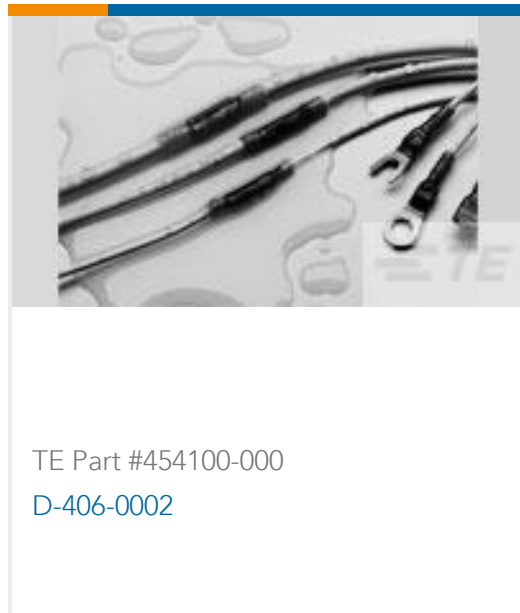
TE Part #454100-000 D-406-0002