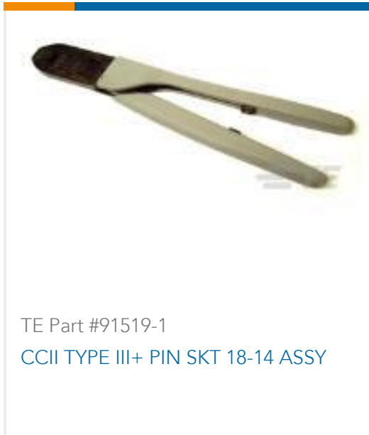
TE Part #91519-1 CCII TYPE III+ PIN SKT 18-14 ASSY