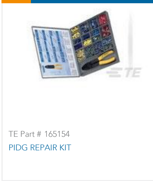
TE Part # 165154 PIDG REPAIR KIT