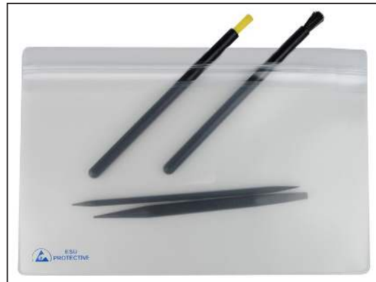
34458 with brush tools and probes (not included)

"It should be understood that any object, item, material or person could be a source of static electricity in the work environment. Removal of unnecessary nonconductors, replacing nonconductive materials with dissipative or conductive materials and grounding all conductors are the principle methods of controlling static electricity in the workplace, regardless of the activity." [ESD Handbook ESD TR20.20-2008 section 2.4 Sources of Static Electricity]