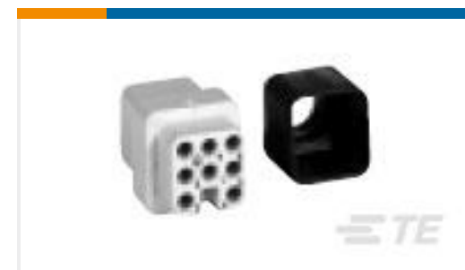
TE Part #2-1103101-3 HN.D.7.BU.C. 250 V