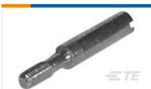
TE Part #1-1106100-1 SPB-M3