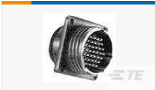
TE Part #182916-1 CPC SQ.FL.RCPT STD SEX