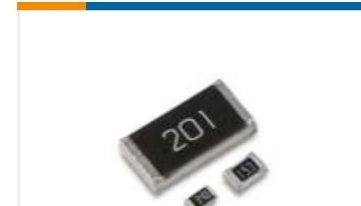
TE Part #4-2176328-7 CRGP 1206 68K 1%