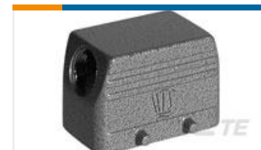
TE Part #2-1102261-6 HB-K.10.STS.1.16.G