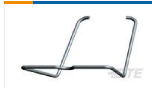
TE Part #5-1419111-9 PT28800