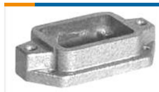
TE Part #2-1102647-5 HIP-K.10/24.AG