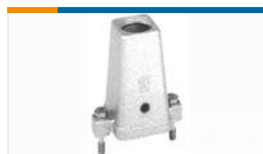
TE Part #1106402-3 EMV-K.3/4.STO.1.M20.G