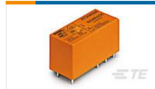
TE Part #5-1393243-9 RT424005