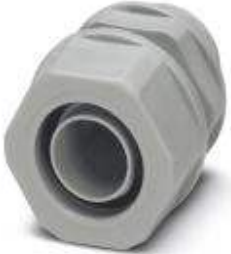
Cable gland made from PP with metric thread, IP65 protection

Please be informed that the data shown in this PDF Document is generated from our Online Catalog. Please find the complete data in the user's documentation. Our General Terms of Use for Downloads are valid ( http://phoenixcontact.com/download )