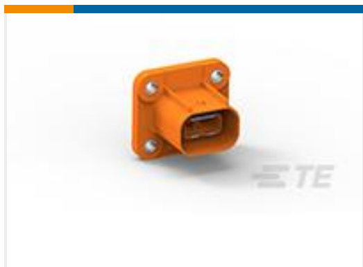
TE Part #2103124-4 HVA280 2P HEADER ASSY, KEY D