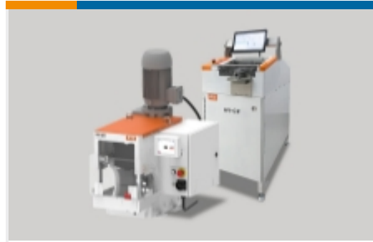
High Voltage Wire Processing Equipment(7)