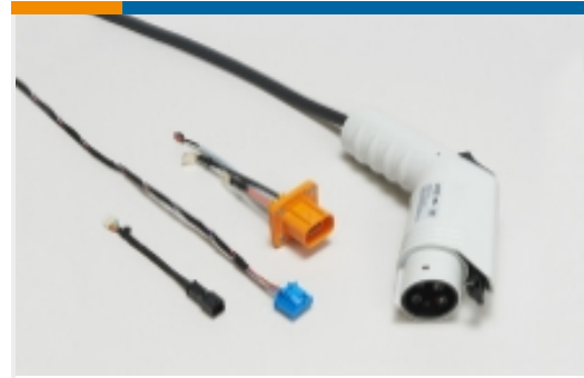
Electric, Hybrid & Fuel Cell Cable Assemblies(6)