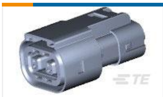
TE Part #2103149-4 PLUG, HVIL ONLY, KEY D, HVA280-2PHI