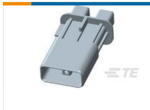
TE Part #2103245-6 Inner Housing, Split Hdr, Key F, HVA280