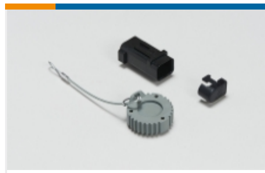
Automotive Connector Caps & Covers (5)