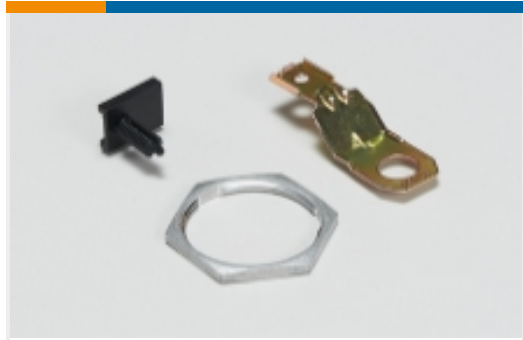
Other Automotive Connector Accessories(37)