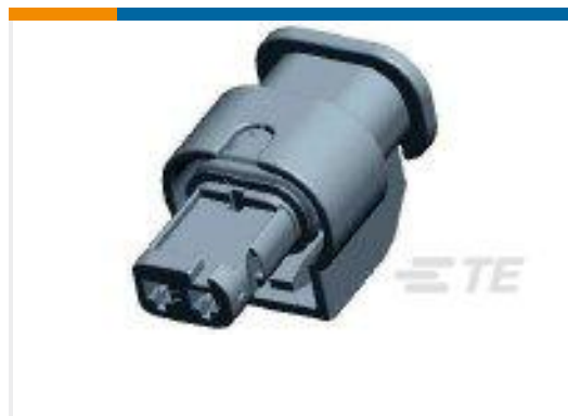
TE Part #1-1670915-1 2POS, MCON 1.2 LL REC SEALED