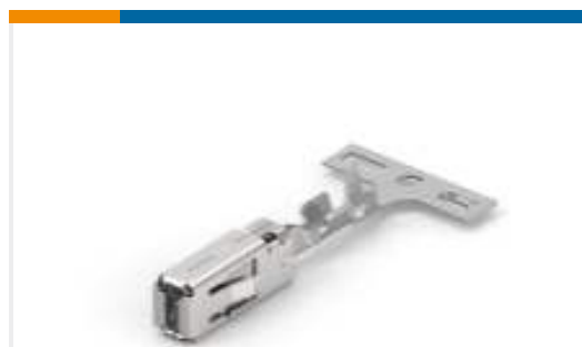
TE Part #1-2141857-1 AMP MCP 2.8, CONTACT