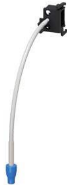
Cable release for reset 0.6 m for 3RU2 Size S00...S3