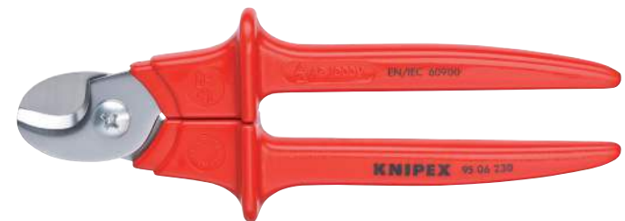
95 06 230 ⚡ 1000V ⚡ ⚡ ⚡ ⚡