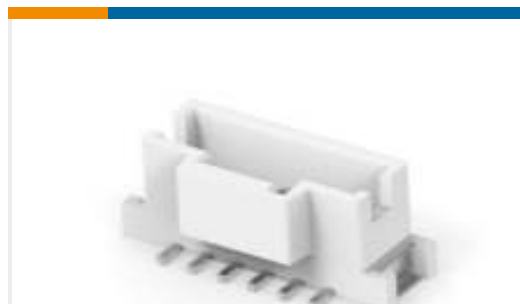
TE Part #1-2232829-6 SGI2.0 HEADER ASSEMBLY SMT 6P, KEY A,NTL