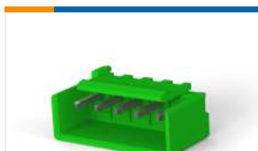
TE Part #1744485-5 05P EP SHRD HDR ASMY, GREEN