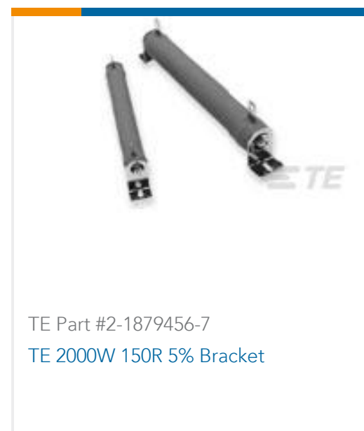
TE Part #2-1879456-7 TE 2000W 150R 5% Bracket