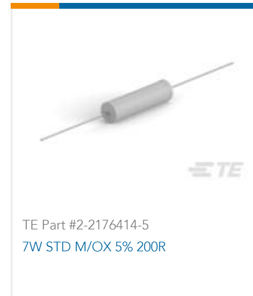
TE Part #2-2176414-5 7W STD M/OX 5% 200R