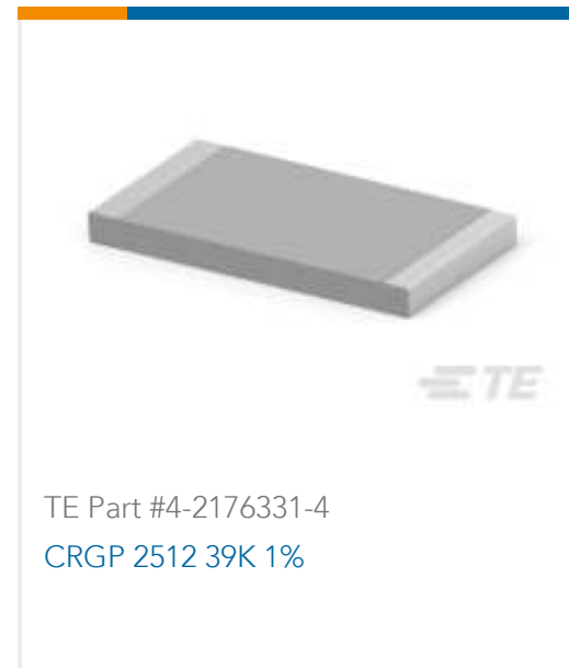
TE Part #4-2176331-4 CRGP 2512 39K 1%