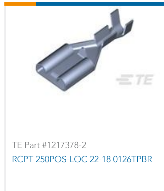
TE Part #1217378-2 RCPT 250POS-LOC 22-18 0126TPBR