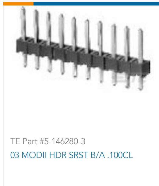
TE Part #5-146280-3 03 MODII HDR SRST B/A .100CL