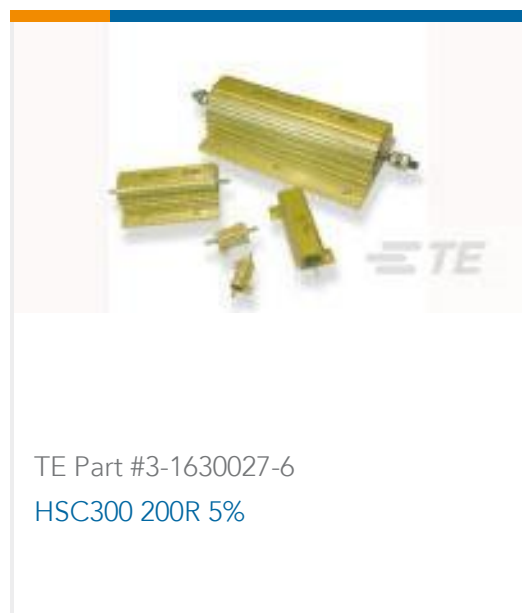
TE Part #3-1630027-6 HSC300 200R 5%