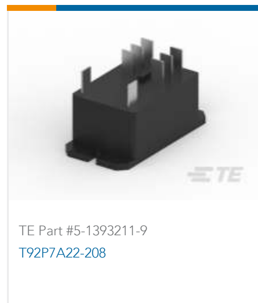
TE Part #5-1393211-9 T92P7A22-208