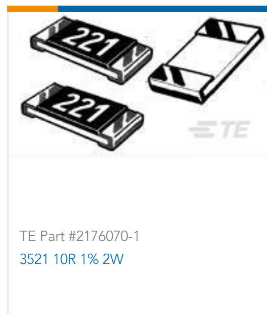
TE Part #2176070-1 3521 10R 1% 2W