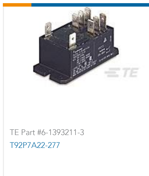
TE Part #6-1393211-3 T92P7A22-277