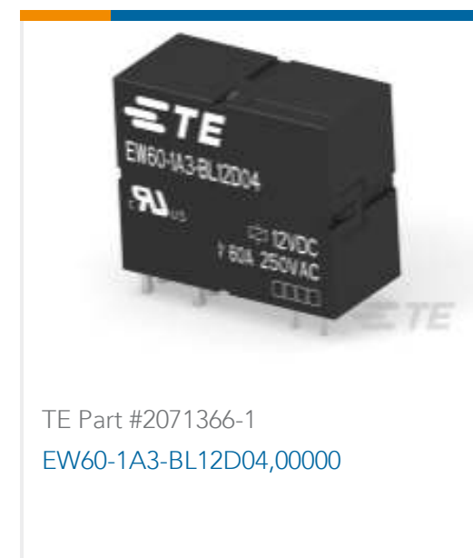
TE Part #2071366-1 EW60-1A3-BL12D04,00000