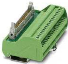
VARIOFACE interface module, for MODICON® TSX Quantum, with MODICON®-specific labeling, for I/O of 32 channels

Please be informed that the data shown in this PDF Document is generated from our Online Catalog. Please find the complete data in the user's documentation. Our General Terms of Use for Downloads are valid ( http://phoenixcontact.com/download )