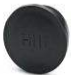
Plastic dust protection cap, anti-static, for RF, SF series connectors, with M23 external thread

Plastic anti-static dust protection cap - RC-Z2469 - 1611797