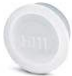
Plastic dust protection cap for connectors with M23 knurled nuts

Plastic dust protection cap - RC-Z2058 - 1604223