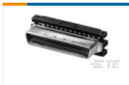
TE Part #5749621-2 26 50S CABLE PLUG CONN/COV KIT