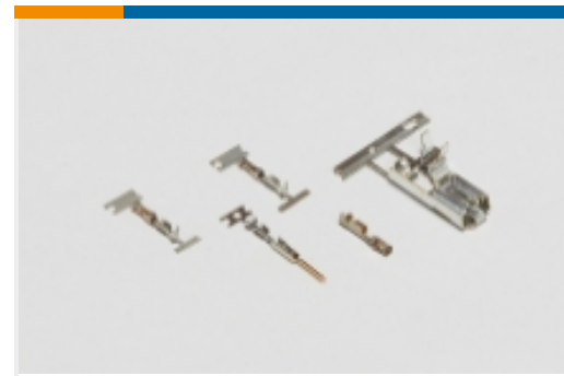
Wire-to-Board Connector Contacts(23)