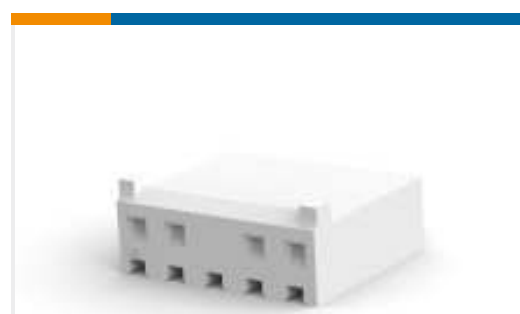
TE Part #647344-5 05P SL156 HSG W/RP TB BLK #3