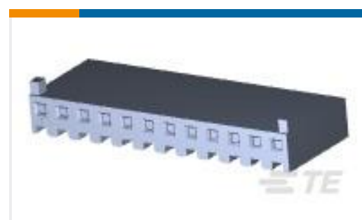
TE Part #1-770996-2 12P SL 156 HSG W/TABS W/O LR