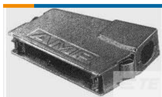
TE Part #5749609-1 26 50SR CABLE KIT-BULK PCKG