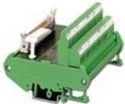
VARIOFACE I/O module, 32 channels for Siemens SIMATIC® S5-95U and S5-100U

Please be informed that the data shown in this PDF Document is generated from our Online Catalog. Please find the complete data in the user's documentation. Our General Terms of Use for Downloads are valid ( http://phoenixcontact.com/download )