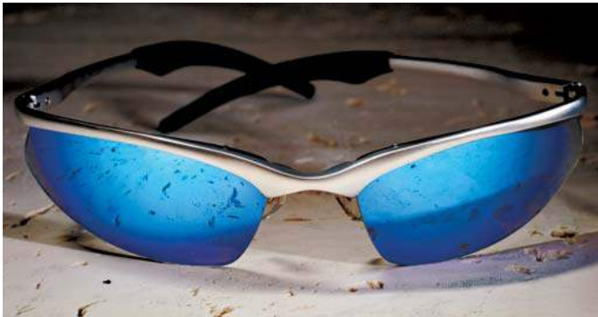
SS1428AS-S, SlvAlumFra BlueMirAS 10ea/cs