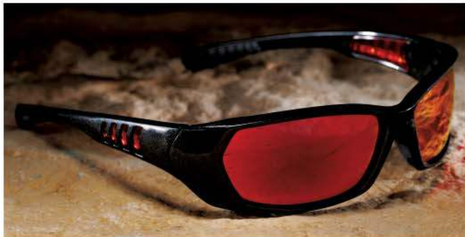
Black Frame with Color-accented Temples, Red Mirror Anti-scratch Lens (SS1629AS-B)

The 1400-Series, simply put, is like a long ride along a coastal highway: smooth, clear, open. Featuring a half-rim design with wraparound aluminum frame, adjustable nosebridge, spring-hinged temples, and blue-mirrored lenses, these glasses come complete with a microfiber storage bag.