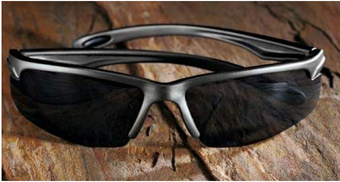
SS1302AF-G, Gray Frame Gray AF 10ea/cs