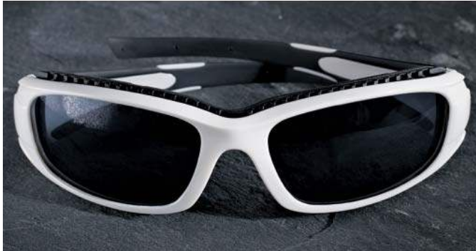
SS1502AF-W, White Frame GrayAF 10ea/cs