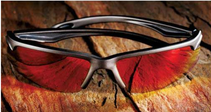
SS1329AS-G, Gray Fr Red Mir AS 10ea/cs

is a lightweight and sport-styled collection that combines clarity and comfort, while featuring a sleek wraparound frame, soft nose pads, and impact-resistant polycarbonate lenses.