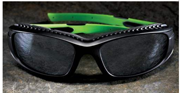
SS1514AS-B, Bk/Gr Frame SlvMirAS 10ea/cs