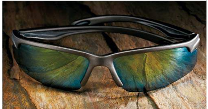
SS1330AS-G, Gray Fr Yel Mir AS 10ea/cs