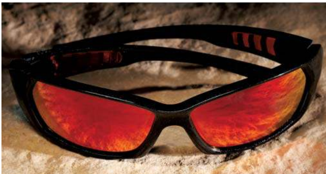
SS1629AS-B, Bk Frame Red Mir AS 10ea/cs

features a wraparound aluminum frame, an adjustable nosebridge, spring-hinged temples and impact-resistant polycarbonate lenses.