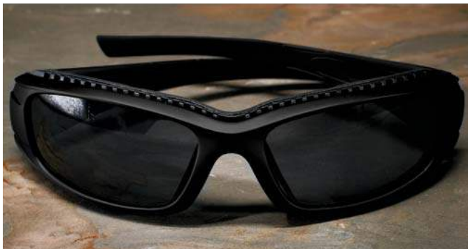
SS1511AF-B, BkFr GrPolarize AF 10ea/cs