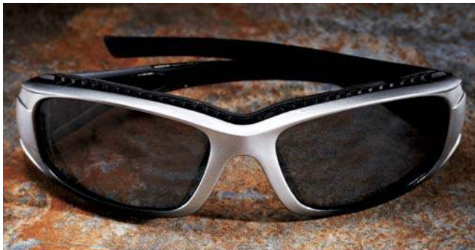
SS1514AS-S, SlvBkFrame SlvMirAS 10ea/cs