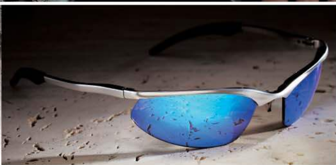
Silver Aluminum Frame, Blue Mirror Anti-scratch Lens (SS1428AS-S)

The 1400-Series, simply put, is like a long ride along a coastal highway: smooth, clear, open. Featuring a half-rim design with wraparound aluminum frame, adjustable nosebridge, spring-hinged temples, and blue-mirrored lenses, these glasses come complete with a microfiber storage bag.