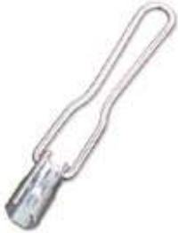
The illustration shows version QSS 22

Socket wrench, for tightening and unscrewing the QUICKON union nut, wrench size 19 mm