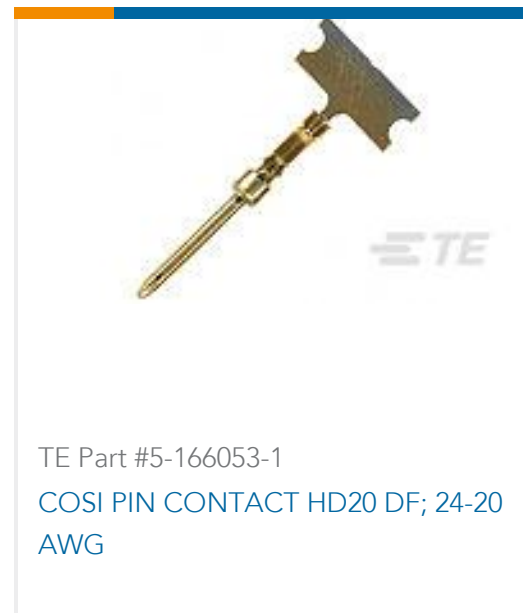
TE Part #5-166053-1 COSI PIN CONTACT HD20 DF; 24-20 AWG