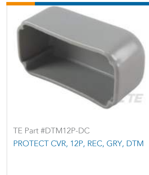
TE Part #DTM12P-DC PROTECT CVR, 12P, REC, GRY, DTM