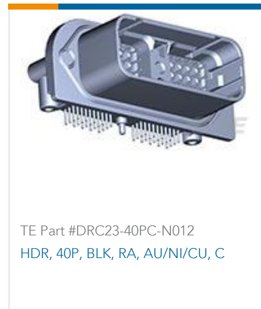
TE Part #DRC23-40PC-N012 HDR, 40P, BLK, RA, AU/NI/CU, C