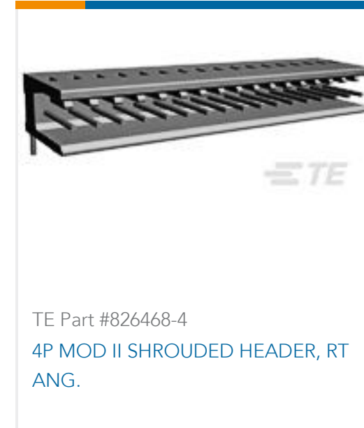
TE Part #826468-4 4P MOD II SHROUDED HEADER, RT ANG.