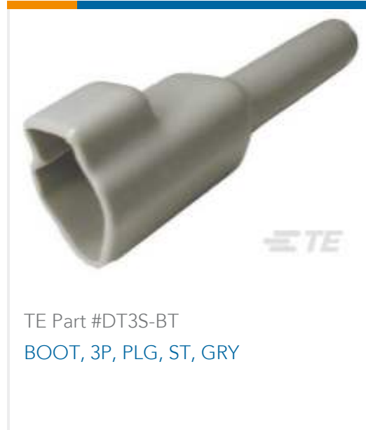
TE Part #DT3S-BT BOOT, 3P, PLG, ST, GRY