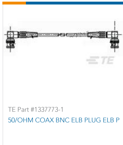
TE Part #1337773-1 50/OHM COAX BNC ELB PLUG ELB P