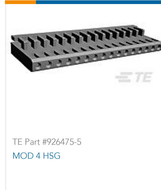
TE Part #926475-5 MOD 4 HSG