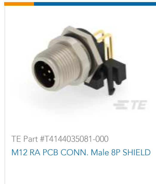
TE Part #T4144035081-000 M12 RA PCB CONN. Male 8P SHIELD