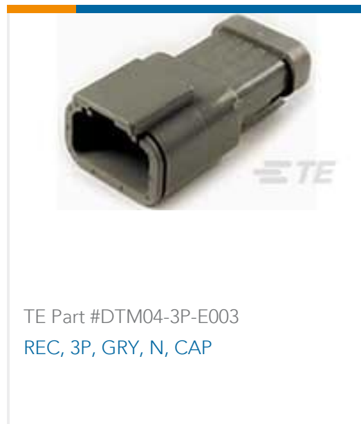
TE Part #DTM04-3P-E003 REC, 3P, GRY, N, CAP