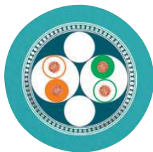
PUR ETHERNET 2x2 FLEX [93E]