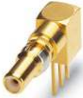
Coaxial contact, for D-SUB combination inserts, for PCB assembly, socket, angled, gold-plated

Please be informed that the data shown in this PDF Document is generated from our Online Catalog. Please find the complete data in the user's documentation. Our General Terms of Use for Downloads are valid ( http://phoenixcontact.com/download )