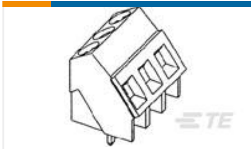
TE Part #1-282847-1 TERMI-BLOK PCB MOUNT 35 11P.