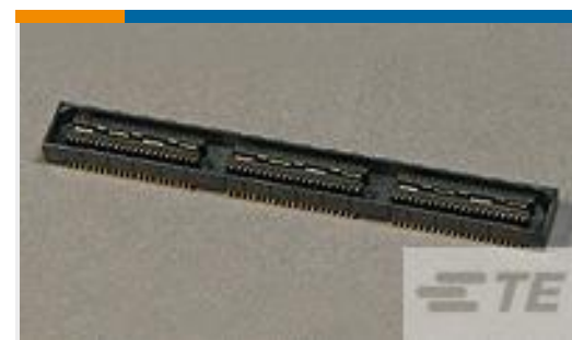
TE Part #7-1658043-3 MSB0.80RC-ASY84DP,GP,F,VCTR