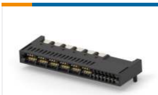
TE Part #2343428-1 HD+ CE, RA, CRPS