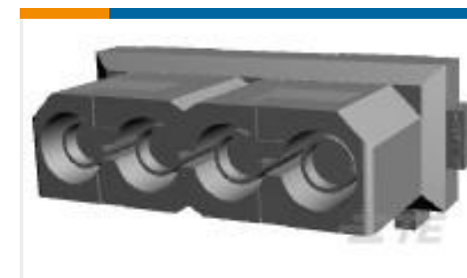
TE Part #1586542-1 04P CMNL SOK HDR ASSY LF