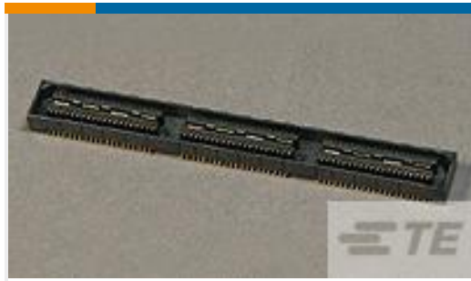
TE Part # 1-1658012-3 MSB0.80RC-ASY84DP,-,10,VCTY