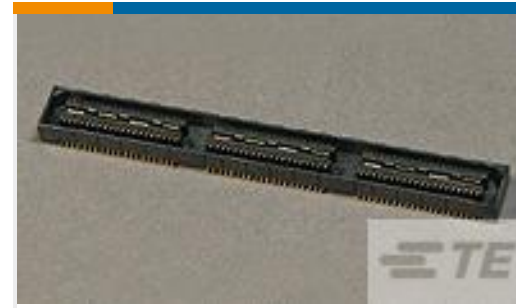
TE Part #1-1658012-3 MSB0.80RC-ASY84DP,-,10,VCTY