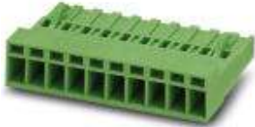
The illustration shows a 15-position version

Plug component, Nominal current: 12 A, Rated voltage (III/2): 320 V, Number of positions: 20, Pitch: 5.08 mm, Connection method: Crimp connection, Color: green, Corresponding female crimp contacts with current [A] and conductor cross section range [mm 2 ] data: 10A/MSTBC-MT 0,5-1,0 (3190564); 10A/MSTBC-MT 0,5-1,0 BA (3190645); 12A/MSTBC-MT 1,5-2,5 (3190551); 12A/MSTBC-MT 1,5-2,5 BA (3190658). BA = Bandkontakte