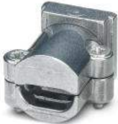
Cable clamp for cable diameter of 5 - 7 mm

Please be informed that the data shown in this PDF Document is generated from our Online Catalog. Please find the complete data in the user's documentation. Our General Terms of Use for Downloads are valid ( http://download.phoenixcontact.com )