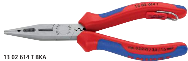
13 02 614 T BKA