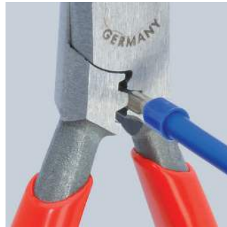
Crimping 20-14 AWG (0.5 to 2.5 mm 2 )