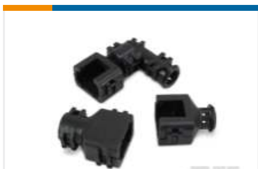
TE Part #2302493-3 AMPSEAL 16 Connectors Backshell