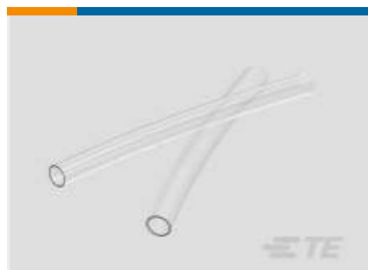
TE Part #C34252-000 ES1000-NO.3-B8-X-55MM