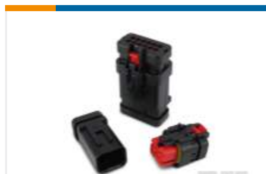
TE Part #2040594-5 AMPSEAL 16 Housings