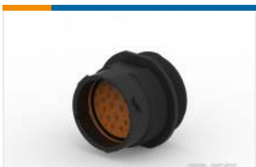
TE Part #YHDP24-24-29PEL024 REC, 29P, BLK, E, WTHD, 12/16/20, P