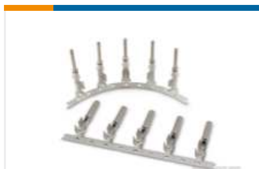
TE Part #776492-2 Contacts: Size 16, 13A