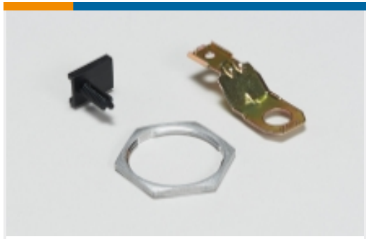
Other Automotive Connector Accessories(11)