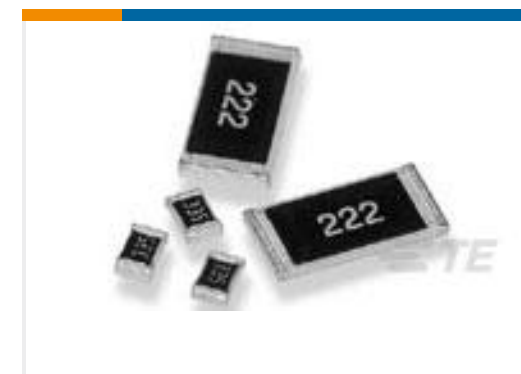
TE Part #7-1676480-8 CRG0402 1% 620K