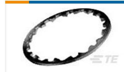
TE Part #1-329492-1 LOCK WASHER COAXICON ORA