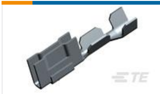
TE Part #1445336-2 LOOSE PC CONTACT 15 AU PLATED