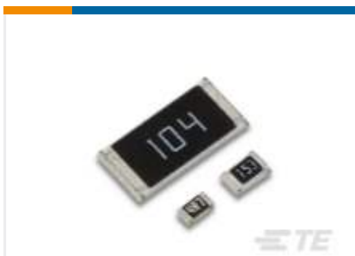
TE Part #1-2176345-5 CRGCO 1210 150R 1%