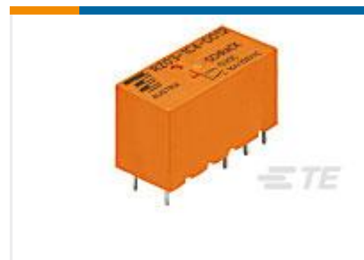
TE Part #7-1415899-0 RZ03-1C4-D012-000C