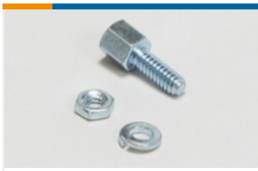
D-Sub Locking &amp; Mounting(119)