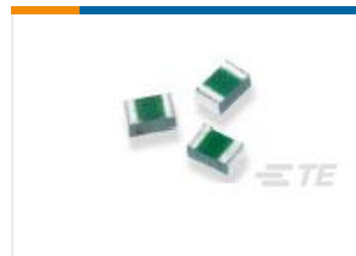
TE Part #1624344-2 NTC0805 5% 100K