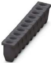
Insulating sleeve, color: black

https://www.phoenixcontact.com/us/products/3002898