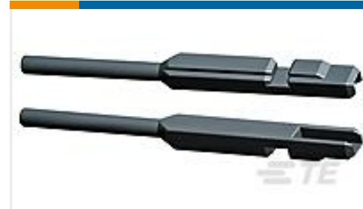
TE Part #1394872-1 SEALING PLUG 1,5MM