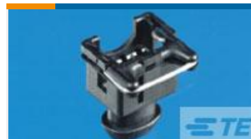
TE Part #282191-1 SPLASH PROOF CONN. W.S.L.