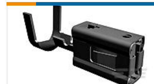
TE Part #1241416-1 AMP MCP 6.3/4.8K, CONTACT, SWS