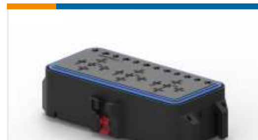
TE Part #2297813-3 BASE ASSY, 27 POSN ISO FUSE AND RELAY