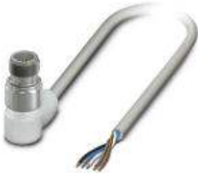
Sensor/Actuator cable, 5-position, PP-EPDM halogen-free, Gray RAL 7035, Plug angled M12, A-coded, on Free cable end, Cable length: 5 m, Hygienic design, With high-grade steel knurl

Please be informed that the data shown in this PDF Document is generated from our Online Catalog. Please find the complete data in the user's documentation. Our General Terms of Use for Downloads are valid ( http://download.phoenixcontact.com )