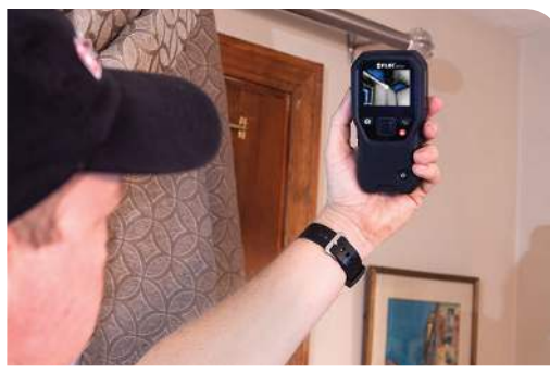
Scanning ceiling & wall joint for moisture issues