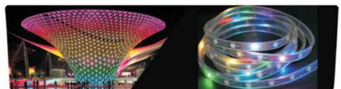
Flexible LED string