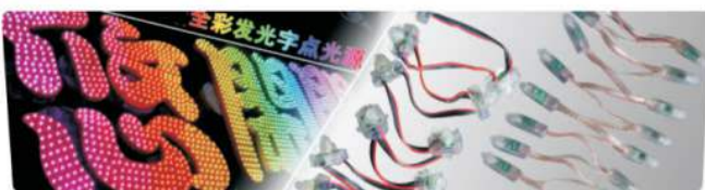
Spot light for advertsing