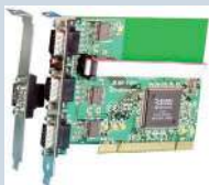
UC-420: uPCI 3+1xRS232