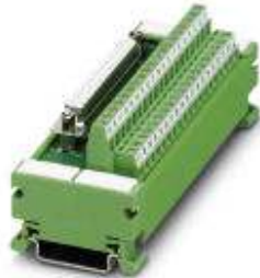
VARIOFACE module, with screw connection and D-subminiature socket strip, for assembly on NS 35/7.5, 37 positions

Please be informed that the data shown in this PDF Document is generated from our Online Catalog. Please find the complete data in the user's documentation. Our General Terms of Use for Downloads are valid ( http://download.phoenixcontact.com )