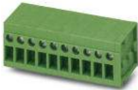
The illustration shows the 10-position version

Please be informed that the data shown in this PDF Document is generated from our Online Catalog. Please find the complete data in the user's documentation. Our General Terms of Use for Downloads are valid ( http://phoenixcontact.com/download )