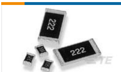
TE Part #1623278-1 CRG0805 1% 6K8