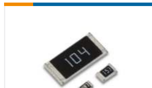
TE Part #1-2176345-5 CRGCQ 1210 150R 1%