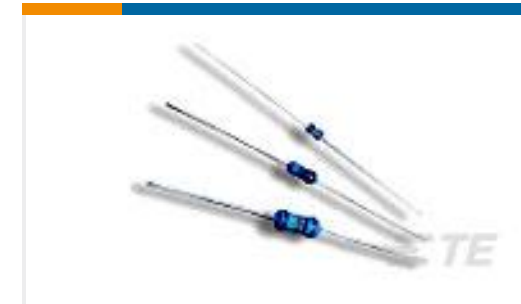
TE Part #1622488-1 LR1 1% 47K