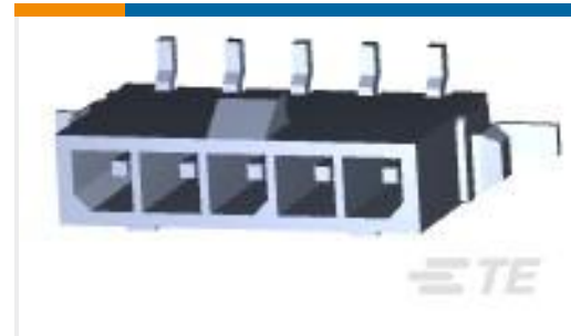
TE Part #2-1445096-5 MICRO MNL HDR ASSY SINGLE ROW