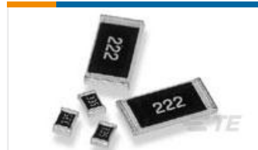
TE Part #1623292-1 CRG0805 1% 8K2