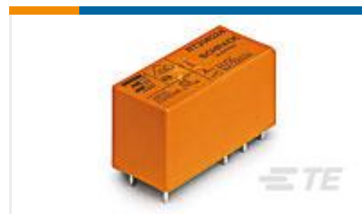
TE Part #1-1649329-6 RT424048