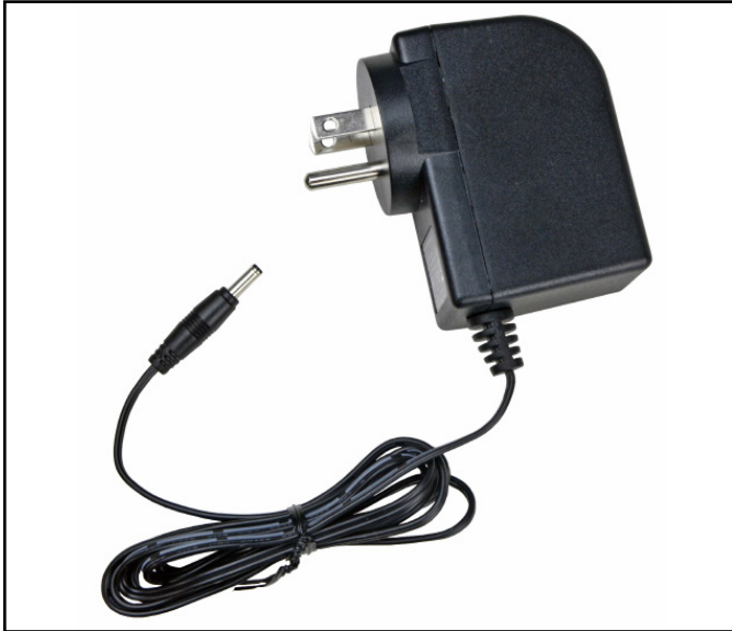
Figure 2. North American power adapter included with the 19239 and 19242 Mini Monitors