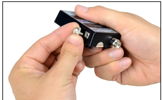
Figure 7. Changing the park snap on the 19243 Mini Monitor

The 19243 Mini Monitor includes an interchangeable 10mm park snap and 10mm banana jack adapter for operators who use wrist cords with 10mm terminations. Use the park snaps' knurled rims to unscrew the 4mm park snap from the monitor and install the 10mm park snap to the monitor. Plug the 10mm operator jack adapter into the monitor's operator jack.