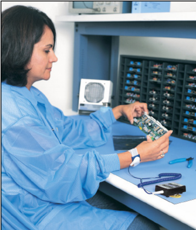
Figure 8. Using the Mini Monitor