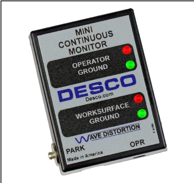
Figure 1. Desco Mini Monitor