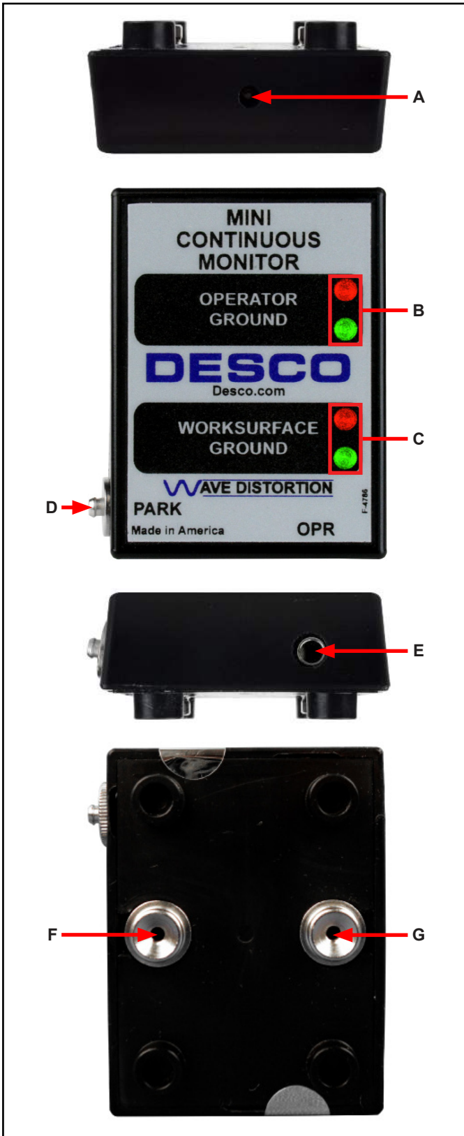
Figure 4. Mini Monitor features and components

A. Power Jack: Connect the included 24VDC power adapter here.