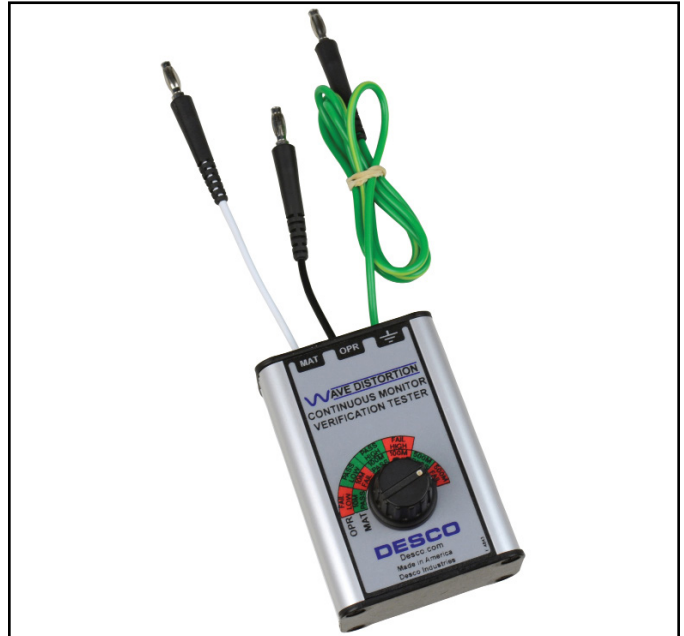
Figure 9. Desco 98221 Wave Distortion Monitor Verification Tester