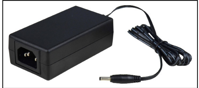
Figure 3. Universal power adapter included with the 19243 Mini Monitor

NOTE: The power cord must be purchased separately if ordering the 19243 Mini Monitor. The power cords are available as the following item numbers: