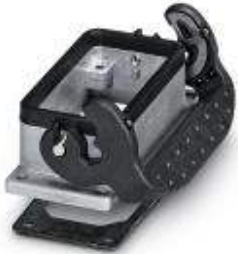
HEAVYCON panel mounting base HV3, with single locking latch, height 27 mm

Please be informed that the data shown in this PDF Document is generated from our Online Catalog. Please find the complete data in the user's documentation. Our General Terms of Use for Downloads are valid ( http://phoenixcontact.com/download )