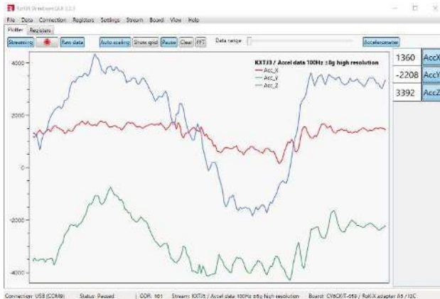
Figure 3. Example RoKiX Windows GUI software window