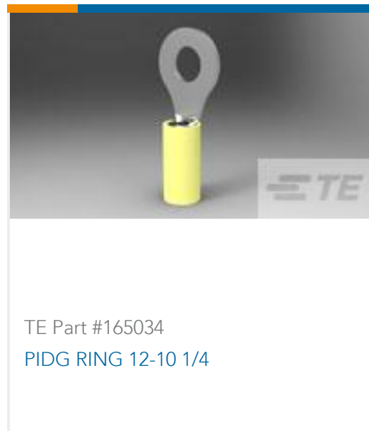
TE Part #165034 PIDG RING 12-10 1/4