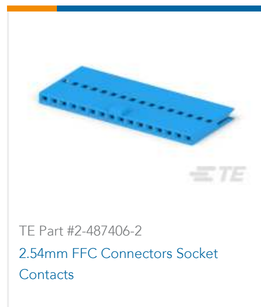
TE Part #2-487406-2 2.54mm FFC Connectors Socket Contacts