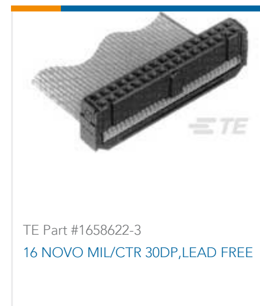
TE Part #1658622-3 16 NOVO MIL/CTR 30DP, LEAD FREE