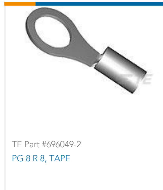
TE Part #696049-2 PG 8 R 8, TAPE