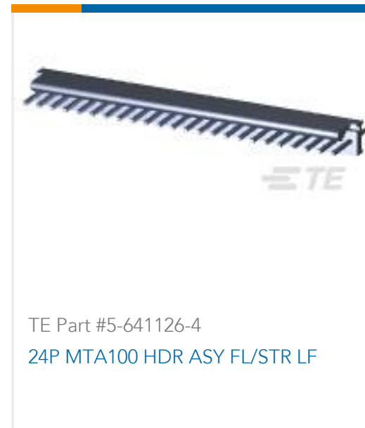
TE Part #5-641126-4 24P MTA100 HDR ASY FL/STR LF