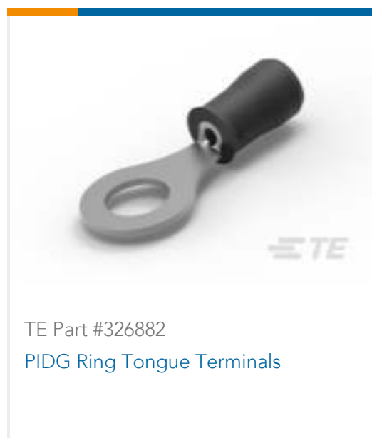
TE Part #326882 PIDG Ring Tongue Terminals