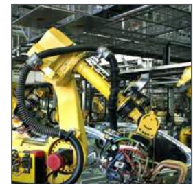
Industrial Automation Assembly Line