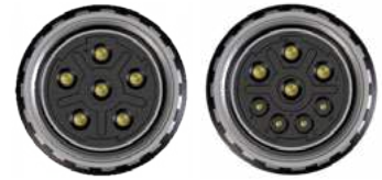
6 Pole (5+PE) and 8 Pole (4+3+PE) Faceviews