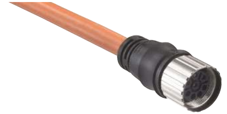
Brad® M23 Power Overmolded Cordset

Resists multiple harsh-environment applications and substances including weld-slag and cutting-oil. Delivers exceptional flexion and torsion performance over a wide operating temperature range