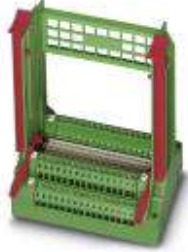
Plug-in card block, Nominal current: 4 A, Number of positions: 64, Pitch: 0 mm, Connection method: Screw connection

Please be informed that the data shown in this PDF Document is generated from our Online Catalog. Please find the complete data in the user's documentation. Our General Terms of Use for Downloads are valid ( http://download.phoenixcontact.com )