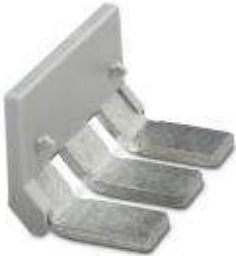
Insertion bridge, Number of positions: 3, Color: gray

Please be informed that the data shown in this PDF Document is generated from our Online Catalog. Please find the complete data in the user's documentation. Our General Terms of Use for Downloads are valid ( http://phoenixcontact.com/download )