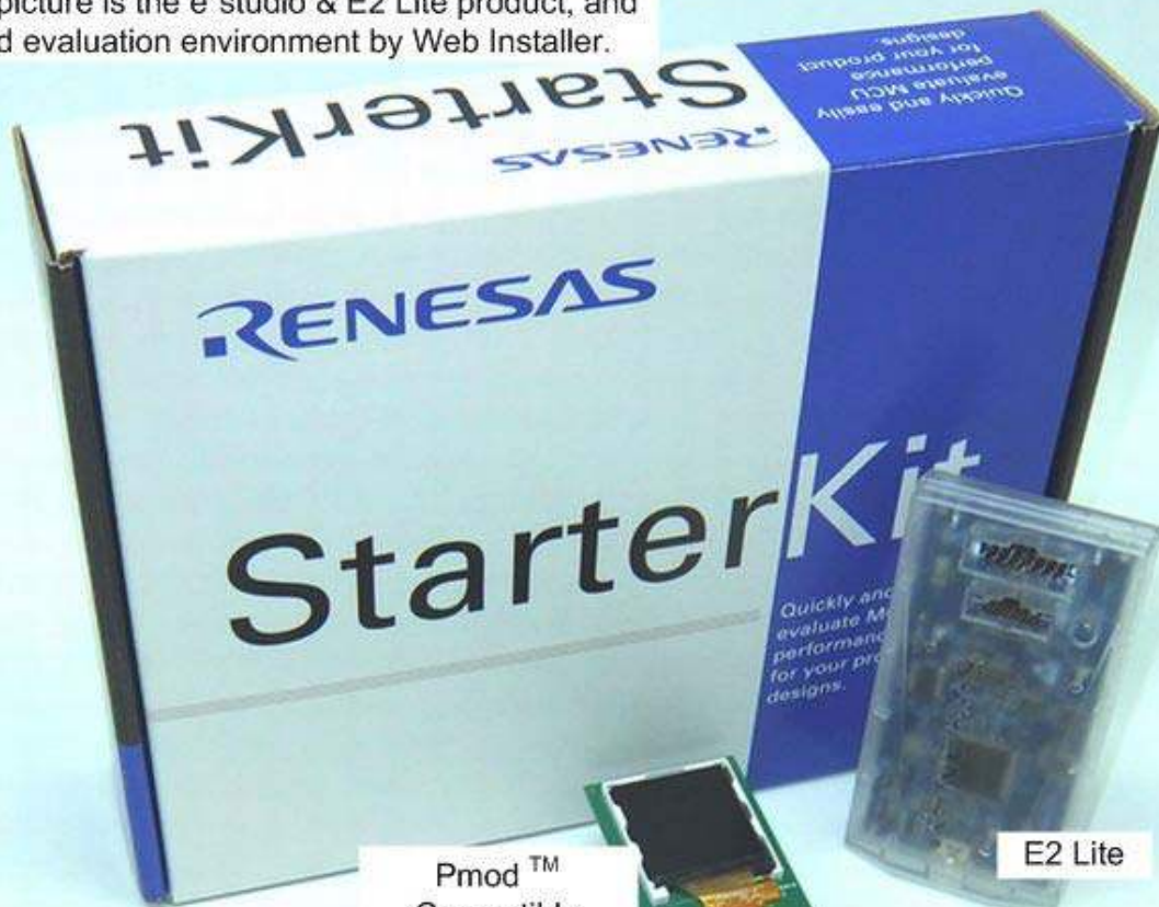
Pmod™ Compatible Color LCD board

This kit picture is the e 2 studio & E2 Lite product, and can build evaluation environment by Web Installer.