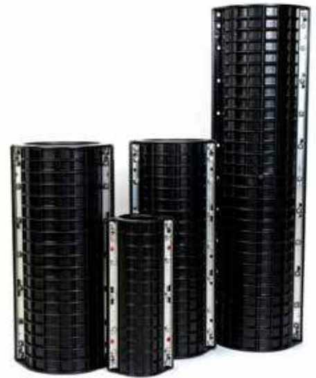
3M™ Pressurized Closure System 2-Type 505