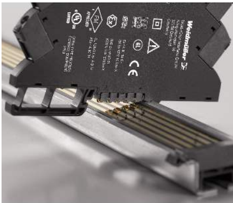
Power supply via CH20M DIN rail bus