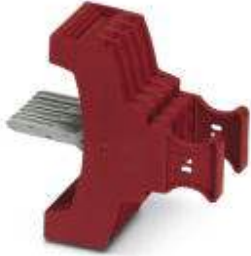
Test plug, Number of positions: 4, Width: 34.2 mm, Color: red

Please be informed that the data shown in this PDF Document is generated from our Online Catalog. Please find the complete data in the user's documentation. Our General Terms of Use for Downloads are valid ( http://phoenixcontact.com/download )