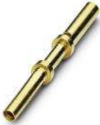
Crimp contact, turned, Contact diameter: 0.6 mm, Crimp range: 0.08 mm 2 ...0.25 mm 2

Please be informed that the data shown in this PDF Document is generated from our Online Catalog. Please find the complete data in the user's documentation. Our General Terms of Use for Downloads are valid ( http://download.phoenixcontact.com )