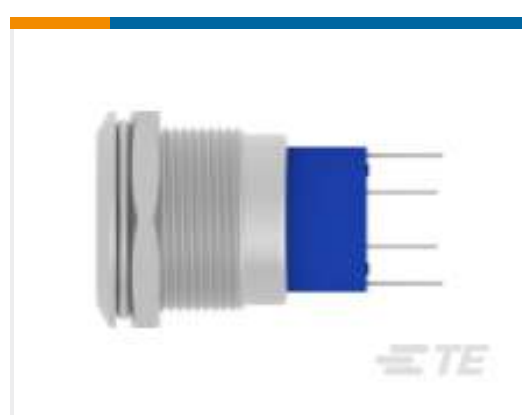
TE Part #1-2316531-3 AV19 DPM 3A MOVING RING R&G 12V