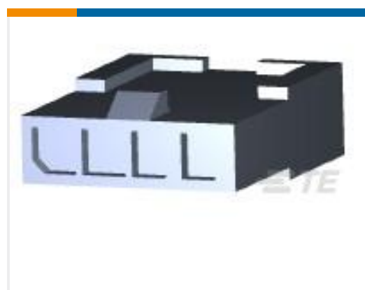
TE Part #1445049-4 FREE HANG SNGL ROW HSG 4 POS