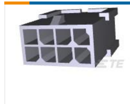
TE Part #794616-8 FREE HANG DBL ROW HSG 8 POS