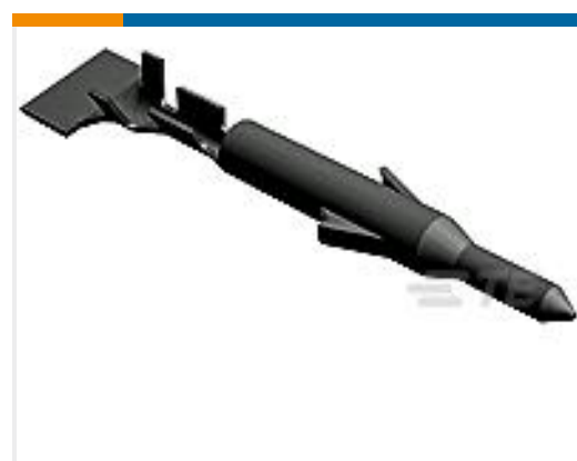
TE Part #770835-1 MINI UMNL PIN SN