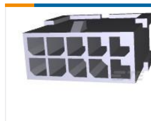
TE Part #1-794616-0 FREE HANG DBL ROW HSG 10 POS