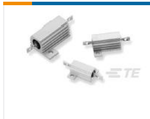
TE Part #1-1879074-8 THS15 15R 5%