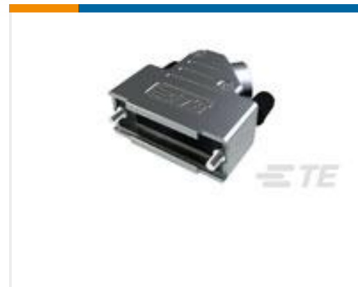
TE Part #2198618-9 Ni Pltd Plastic Backshell, 9 Way, 45 Deg