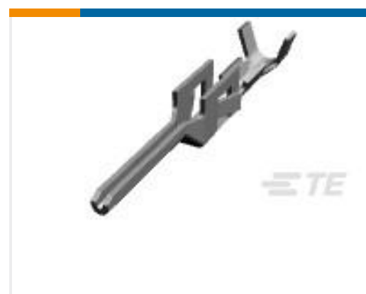
TE Part #1-794613-0 PIN CONT 26-30 TIN PLATE L/P