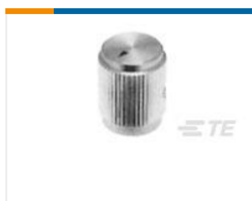
TE Part #5-1437622-5 KN501BA1/8=KNOB BLK/ALUM 1/8 I